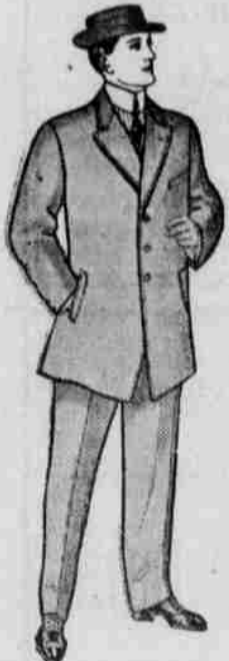
Three Button Novelty Sack, No. 516.

Clothes we supply in our custom tailoring department are made exactly to the measure of the individual by the "House of Over a Thousand Tailors," Ed. V. Price & Co., of Chicago, and cost you about half the charges of a small tailor.