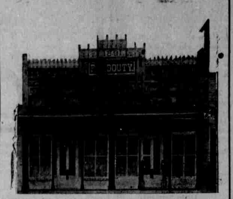
People's Cash Store INDEPENDENCE Use the Entire Floor Space of this building.

We are in that position. We are forced to make this stock move. Hence this sale.