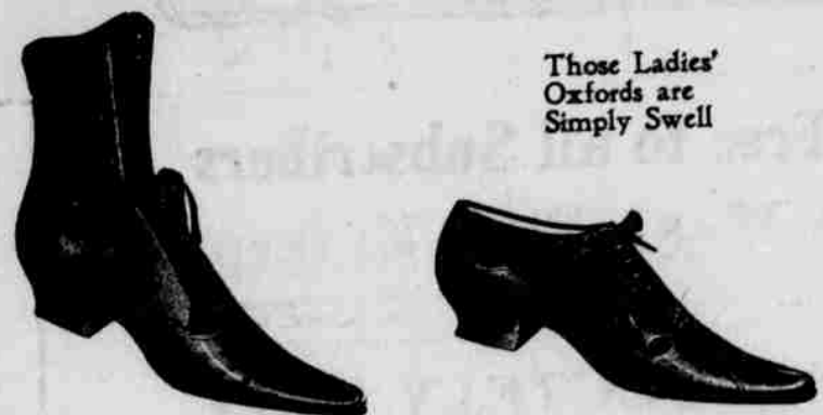
Those Ladies' Oxfords are Simply Swell

Complete Line Both Ladies' and Gents' at Paddock's