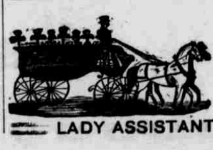
LADY ASSISTANT WHEN DESIRED

Have you seen those fine leather back author books at Wagoner's? They will make someone a fine Christmas present.