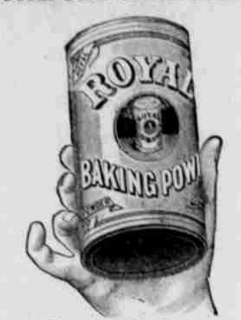
Absolutely Pure THERE IS NO SUBSTITUTE