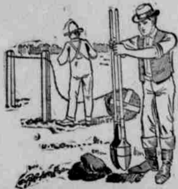
Farm, Garden and Household Hardware.

If you are going to build come in and look over our very complete line of Hinges, Doorlocks, Brackets, etc. We are recognized headquarters for