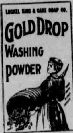
3 pound package for 15 cents this week.

Commencing Monday July 7. Ending Saturday July 12th.