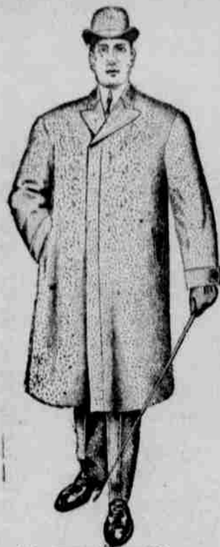
FRIEND BROTHERS CLOTHING CO., MILWAUKEE, WIS.