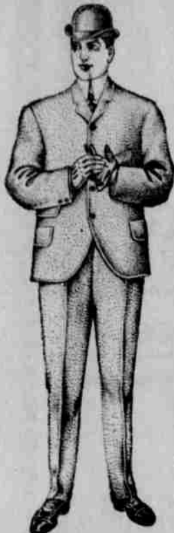
FRIEND BROTHERS CLOTHING CO., MILWAUKEE, WIS.

A very fine selected stock, representing the celebrated firms T. D. Barry's and Buckingham & Hecht's