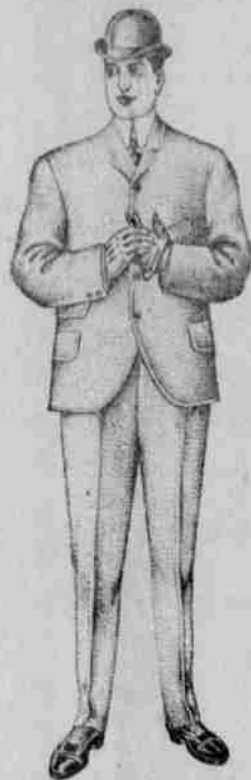
FRIEND BROTHERS CLOTHING CO. MILWAUKEE, WIS.

A very fine selected stock, representing the celebrated firms T. D. Barry's and Buckingham & Hecht's