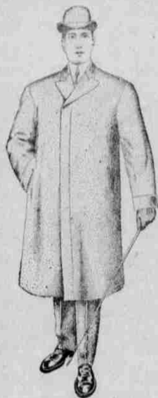
FRIEND BROTHERS CLOTHING CO. MILWAUKEE, WIS.