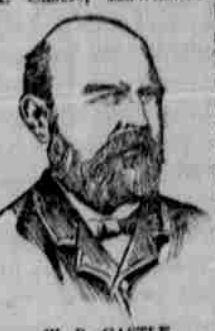
W. R. CASTLE.

General I. The shortest name in the world is developed by the war between Japan and China. It is that of General I, a Tartar commander, who has perhaps distinguished himself above other Chinese generals, having conducted a campaign—though a losing one—of some effectiveness.