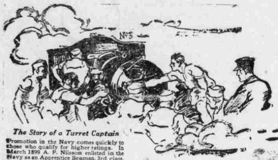
The Story of a Turret Captain