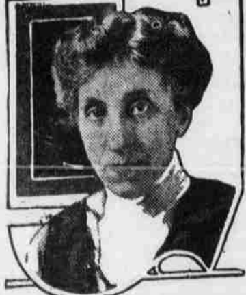
Miss Juffa C. Lathrop, director of Children's Bureau of the Department of Labor, has made such wonderful showing in child conservation and welfare, since her appointment by President Taft in 1912, that she has been asked by the Czech-Slovak government to visit Europe and tell them how to do it.