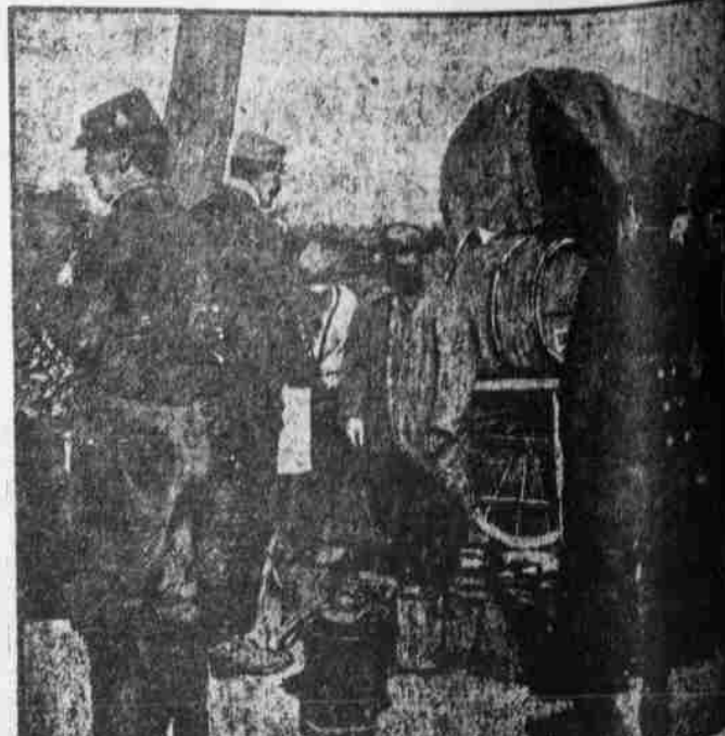
This shows the arrival of wagons containing... Fresh troops at the front. Wine is the favorite beverage and no meal is complete without it.