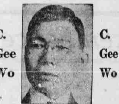
THE CHINESE DOCTOR

His Remedies Act Quickly and Painlessly.