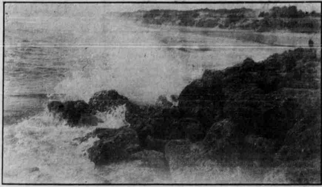
The ruggedness of the Oregon coast presents many a picturesque scene when the incoming billows dash and foam over jutting crags and half-submerged rocks. Here the clam digger finds the rarest sport and the agate hunter is lured on and on after the receding breaker in search of rarest stones. The above scene gives a view of an incoming sea breaking in fine spray over the rocks. In the distance is an old government lighthouse, set there years ago to warn the passing steamer of the nearness of dangerous rocks. The scene is typical of the Western coast, offering, as it does, an illustration of a topography that is quite general.

musical compositions is limited for any piano equipped for use with the perforated roll. . . . The unlimited possibilities of the Jacquard principle over any other thus constitutes one of its greatest advantages. Any change or modification in a series of operations with the paper strip may be made simply by preparing a different set of perforations, just as one written order of instructions supersedes another; and thus it appears that a form of control in which instructions are positively combined with their execution is available for the most intricate manufacturing operations."