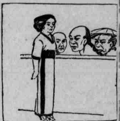
Gazing at Wax Figure.

Chinese merchants in Hongkong's Chinese quarter who have adopted this