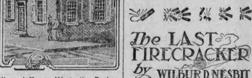
Where Jefferson Wrote the Declaration of Independence.

"The sage of Monticello" stands to day next to "the father of his country" in the esteem of the United States. And this is as it should be, for his wise counsel helped to establish this nation as firmly as did the arms and statesmanship of George Washington.