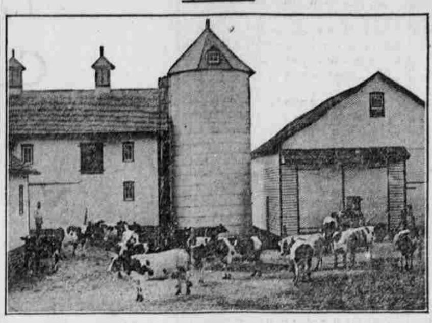
A Modern Dairy Silo.

Dry Pastures and Burned-Up Hillsides Following Drought of 1910 Teach Lesson That Shoud Not be Forgotten-Eloquent Though Severe Plea for Summer Silo for All Farms.