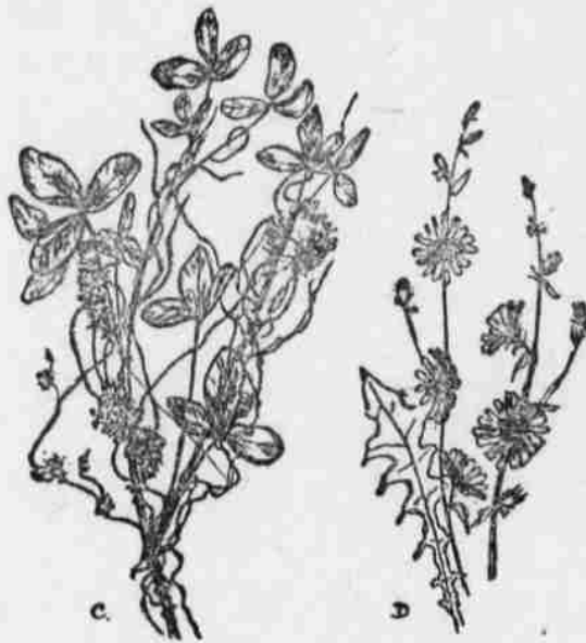
C. Field Dodder. D. Chickory.

Wild carrot has become more widely distributed with clover seed than any other weed in the country. It is an extremely common weed in the east where it has long been known as troublesome to crops. Wild carrot is