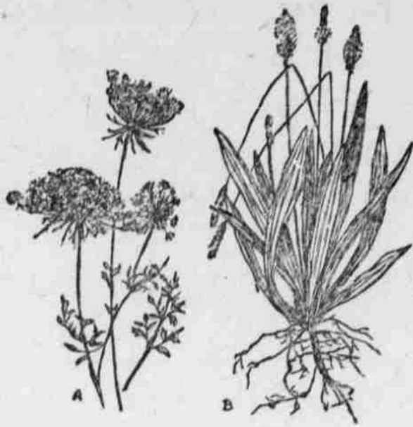
A. Wild Carrot. B. Ribgrass.

Farmers Should Carefully Observe and Study Habits of All Noxious and Injurious Plants in Order to Fight Them to Best of Advantage—Every Effort Should be Made to Get Rid of Them.