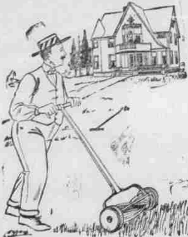
LAWN MOWERS—NUF SAID.

WE HAVE THE SWELLEST LINE OF HARNESS GOODS IN POLK COUNTY, AND INVITE YOU TO CALL AND LOOK OVER OUR HARNESS DEPARTMENT. THIS IS THE MONEY SAVING FEATURE FOR HARNESS USERS. WE HANDLE NONE BUT THE BEST.