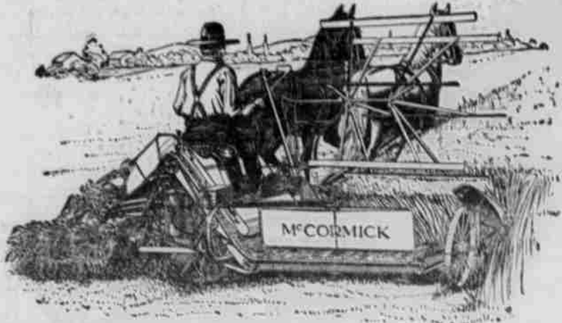
MCCORMICK BINDER—5, 6 AND 7 FOOT CUT. BEST ON EARTH.

MCCORMICK BINDERS and MOWERS ARE RECOGNIZED THE WORLD OVER AS THE SUPERIOR ARTICLES ON THE FARM. MCCORMICK MACHINES ENABLE THE FARMER TO HARVEST HIS CROP QUICKLY AND CONSEQUENTLY A LARGE AREA CAN BE DEVOTED TO GRAIN. WE WILL BE PLEASED TO SHOW YOU THE SUPERIORITY OF MCCORMICK CONSTRUCTION, AND GIVE YOU ANY INFORMATION YOU MAY DESIRE RELATIVE TO THE MACHINE.