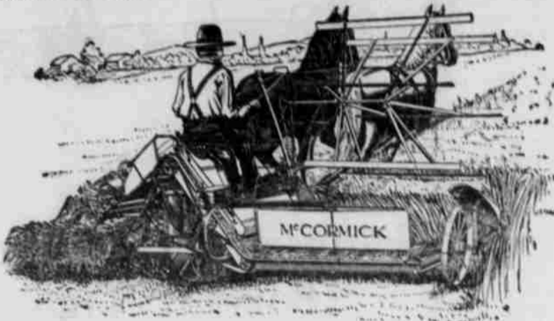
McCORMICK BINDER—5, 6 AND 7 FOOT CUT. BEST ON EARTH.

McCORMICK BINDERS and MOWERS ARE RECOGNIZED THE WORLD OVER AS THE SUPERIOR ARTICLE ON THE FARM. McCORMICK MACHINES ENABLE THE FARMER TO HARVEST HIS CROP QUICKLY AND CONSEQUENTLY A LARGE AREA CAN BE DEVOTED TO GRAIN. WE WILL BE PLEASED TO SHOW YOU THE SUPERIORITY OF McCORMICK CONSTRUCTION, AND GIVE YOU ANY INFORMATION YOU MAY DESIRE RELATIVE TO THE MACHINE