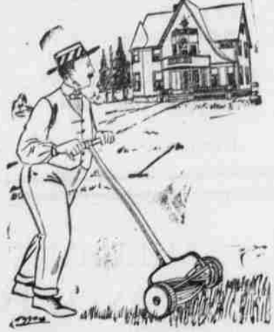
LAWN MOWERS—NUF SAID.

WE HAVE THE SWELLEST LINE OF HARNESS GOODS IN POLK COUNTY, AND INVITE YOU TO CALL AND LOOK OVER OUR HARNESS DEPARTMENT. THIS IS THE MONEY SAVING FEATURE FOR HARNESS USERS. WE HANDLE NONE BUT THE BEST.