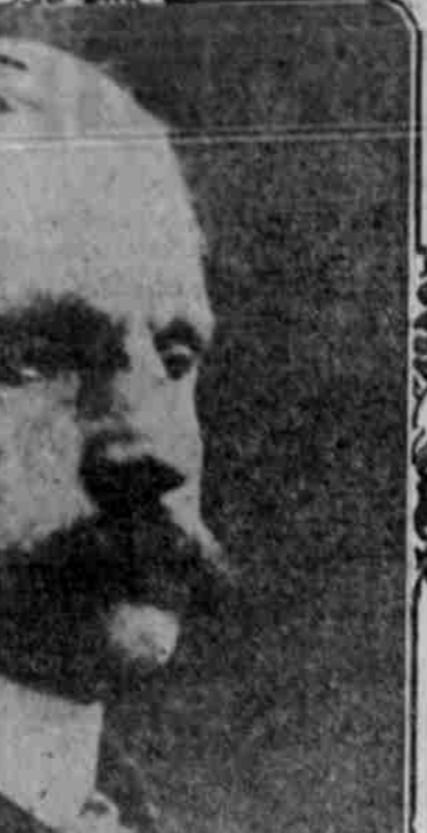
Count Leo Tolstoi.

Letter Brings Fortune. Leipsic, Saxony.—At an autograph sale here a letter written by Martin Luther to Emperor Charles V was bought by a Florence dealer for $25,500. The purchase is said to have been made for J. P. Morgan. The letter, which is in Latin, was written in 1521 during the reformer's return journey from Worms, describing the proceedings and defending his attitude before the diet. The epistle was entrusted to an imperial herald, who gave Luther safe conduct through the Thuringian forest.