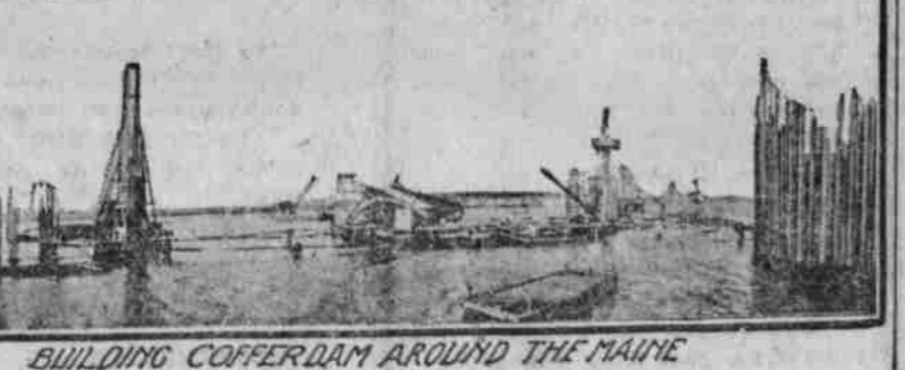
BUILDING COFFERDAM AROUND THE MAINE

Briefly and non-technically, the plan being used to raise the vessel is as follows: A series of cylinders—20 in number—forming a cofferdam, are being sunk in the water, silt and mud around the wreck. These cylinders, when completed, will form an egg-shaped dam encircling the wreck. This dam will be made watertight and the water inside pumped out. Hydraulic pumps will suck out the mud and the