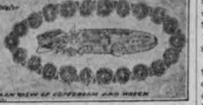
PLAN VIEW OF COFFERDAM AND WRECK

The Maine at the time of the explosion was swinging with her nose toward the Havana shore, and the wreck lies in a line almost west and east, bow and stern. The buoy to which she was moored was about three-eighths of a mile from the west shore of the bay. The wreck lies in about the center of the harbor. On the 15th of February each year the Americans in Havana have visited the wreck and decorated it with