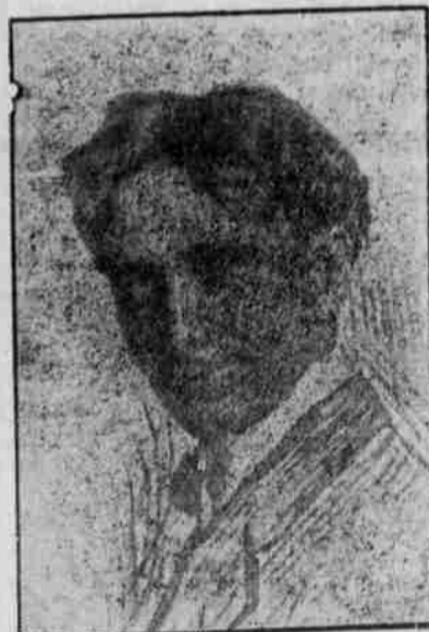
Who will lecture at the Star Theater Monday night.