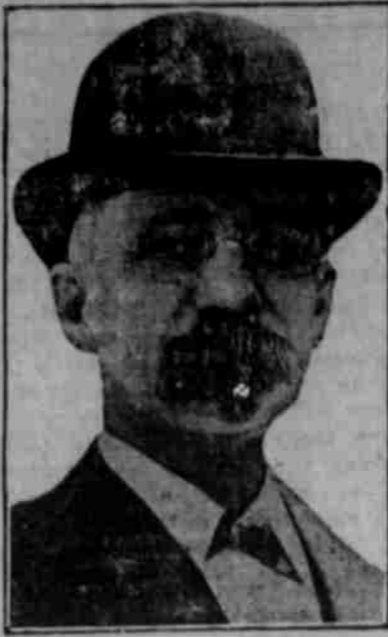
EDWARD H. HARRIMAN.

Arden, N. Y., Aug. 31.—Edward H. Harriman came out with a statement that he was all right. Though brief, the statement is straightforward and explicit, with perhaps a touch of patient resentment at the surveillance to which he has been subjected and with a request that reporters withdraw, not so much for