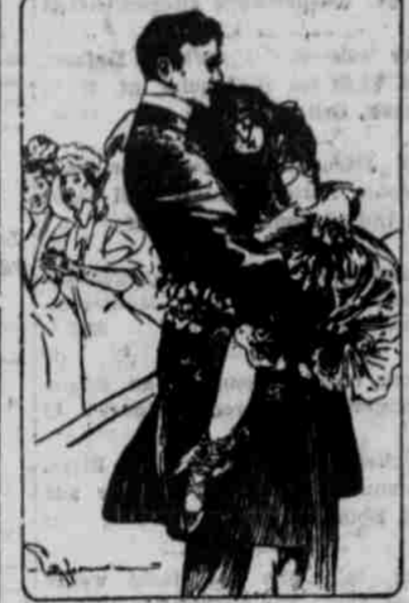
In the young pastor's arms was a white, spangled burden of humanity.

"I didn't have enough money for that," Douglas answered frankly. He turned to the small boy and pinched his ear. There was sad disappoint-