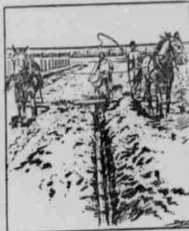
FIG. IX--COVERING THE TILE DITCH.

Fields with a clay subsoil withstand dry weather much better than those with a subsoil of sand or gravel. The latter, because of their looser texture,