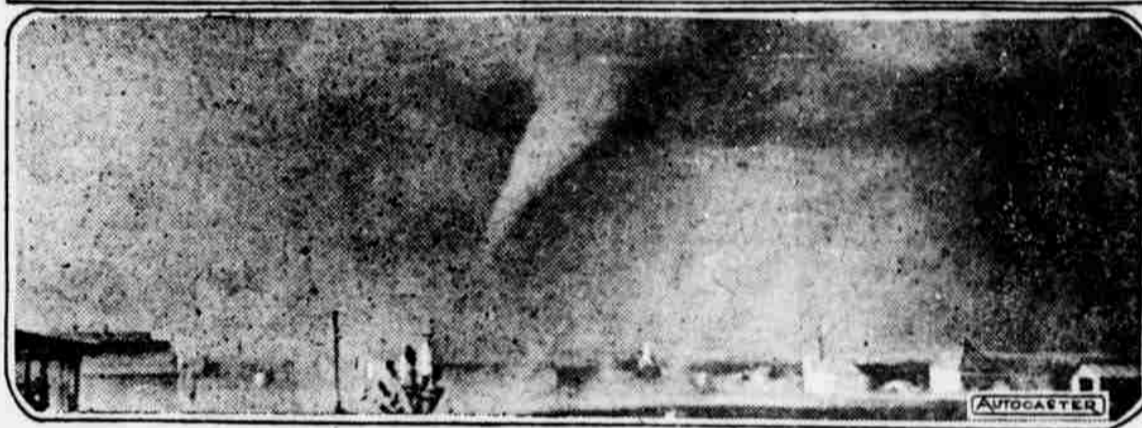
A cool-headed photographer was sitting on his front porch at Weskan, Kansas, the other day when the great cyclone and tornado, which swept middle western states, reached his town.