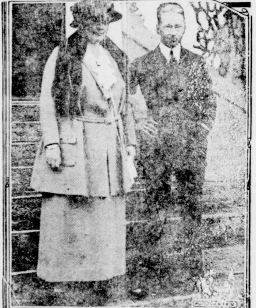
Here is the first and exclusive picture of the German former Crown Prince at home again. With him is his wife, who stayed in Germany through his five years of exile in Holland. This picture was taken at Oels, where they are now living in his castle there.