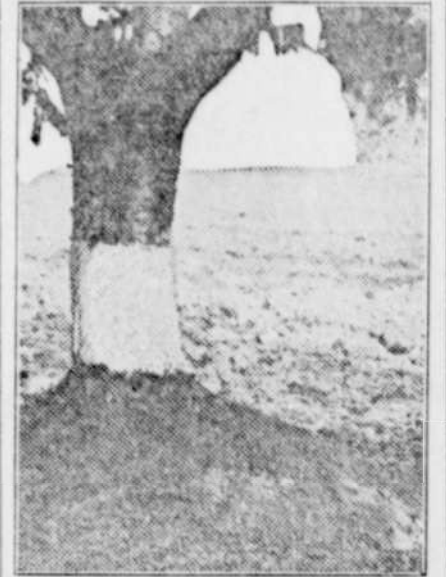
Application of Para-Dichlorobenzene, Whitewash and Mounding of Earth Around Tree Trunk Will Reduce Injury by Borer.