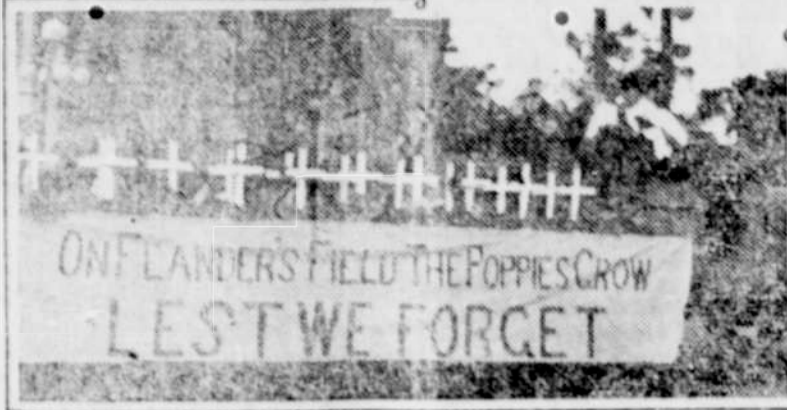
The men of Monmouth County, New Jersey, who were killed in the world war were represented in the parade at the annual convention of the New Jersey American Legion by a float bearing a replica of a military cemetery with a tiny grave for each departed hero and a cross bearing his name.