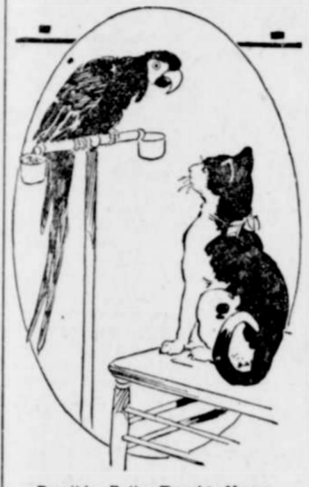
Possibly Polly Taught Mousy.