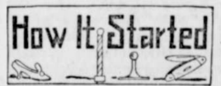
THE REAPING MACHINE.