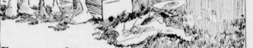
Fishin' Worm Oil

All right! I'm a' comin' as fast as I can, and I'm