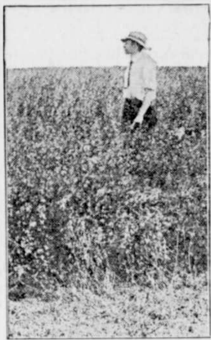
An Excellent Stand of Alfalfa.

Experiments on government plats seem to prove that cutting is not essential to the welfare of the plant, but is only a means of getting hay. Plats of alfalfa that have not been cut