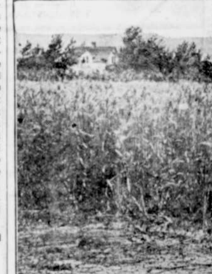
Healthy Field of Wheat.

The bugs are certain to migrate when the wheat ripens and the corn will be so backward that damage by the bugs is likely to be very severe. It is well to expect the bugs to begin migrating to corn as soon as the wheat butts begin to harden into maturity ten days before the heads are ripe. Any barrier work or creosote repellant line work should begin as the bugs will migrate in increasing numbers as the wheat stalk ripens upward. The binder will shake loose those not already out and stragglers will continue to migrate in serious numbers for five