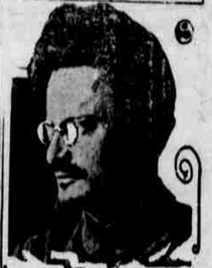
Latest pictures of Trotsky show that he has donned the military uniform in his attempt with Lenin to reorganise the world.