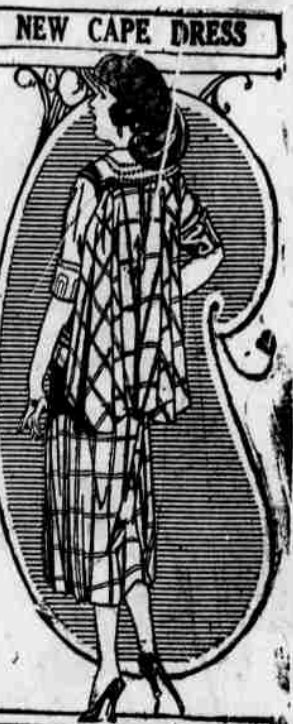
This snappy street dress is a light tan and blue plaid wool. The waist is silk tulle. The cape hangs loosely, attached to the waist beneath the collar.

Wanted—A gentle riding pony. A. C. Canterbury 2t