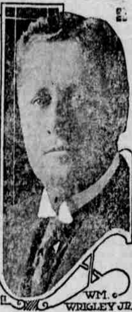
WM. WRIGLEY JR.

Mr. Wrigley's Poland-China boars are The Clansman, for which he paid $15,000 and has refused an offer of $50,000, and The Advancer, a young boar, for which he paid $3000.