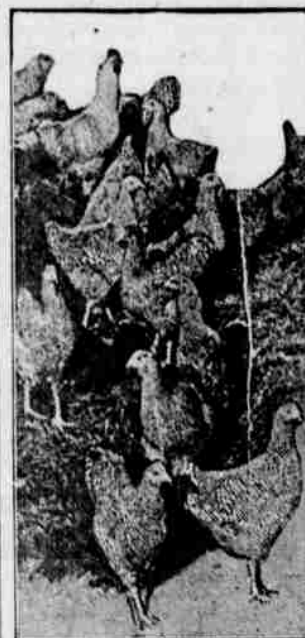
A Well-Selected Flock of Young Hens of Uniform Size, the Kind That Make Excellent Winter Layers.

A striking example of community breeding accomplishment is furnished by the Barred Plymouth Rock association, Farmville, Va. Organized for