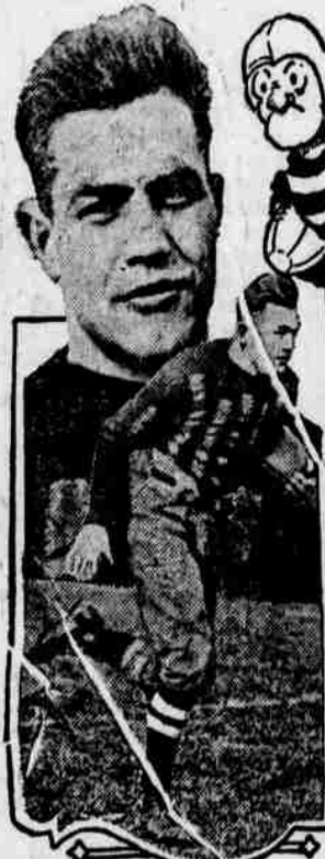
Captain "Chick" Harley of Ohio State grid team, is proving conclusively for all time that he is one of the greatest football players of his day. In 1916 Harley was selected All-American, fullback by Walter Camp, then went to war. Harley got away for a 55-yard run, beating Post's great Michigan team in his first big game this year.