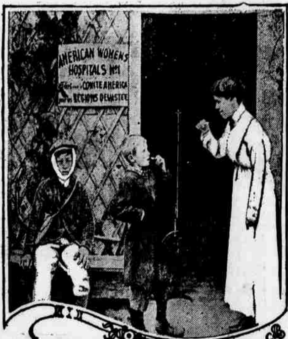
Toothbrush drill supersedes fatigue duty in the devastated districts of France. American women dentists have their unit located in a picturesque office near Vico-sur-Aiane. They have performed 1674 operations and treated 288 patients in one month.