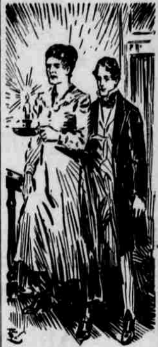
She Took a Candle and Led Me Up a Broad Oaken Stairway.

asked. "Sunk in the soft embrace o' lux- ury," he answered. "Grimshaw made him; Grimshaw liked him. He was always ready to lick the boots o' Grim- shaw. It turned out that Grimshaw left him an annuity of three thousand dollars, which he can enjoy as long as he observes one condition."