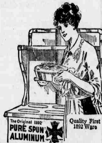
The Original 1892 PURE SPUN ALUMINUM Quality First 1892 Ware