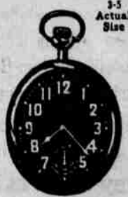
Waterbury Radiolite $4.50 Smart, stylish and up-to-the-minute. A man's watch.