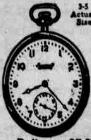
Reliance $7 50 (Gold-Filled) The graceful Reliance in an extra quality 18-year guaranteed case. In dust-proof screw case, $5.00.