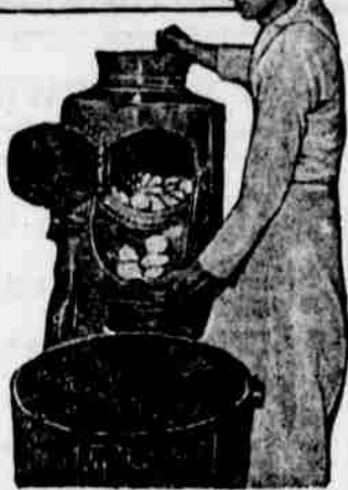
HOW THEY PEEL POTATOES ABOARD SHIP

tatoes in America for greater use in every home and for all needs of army and navy. Eat more potatoes, eat less wheat.