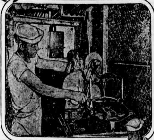
SLICING BACON ON BATTLESHIP

J ACKIES in the American navy are classed as the best fed body of men in the world. In the ship's galleys every effort is made to eliminate waste.