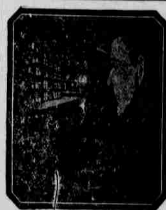
Shows Time in the Dark

The Rebekahs celebrated St. Patrick's night last evening with an appropriate program which included a feed.