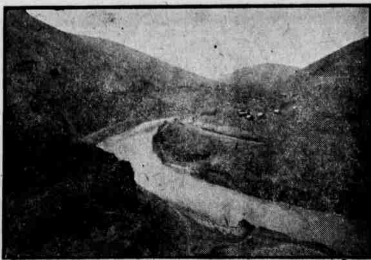
In the Deschutes River Canyon

The fight between Hill and Harriman lines for possession of Eastern Oregon presented many interesting situations. Entering the coveted territory by the Deschutes river canyon, the rival railroads pushed their lines of construction down either side of the river, one camp being ahead one day and the other the next. The above illustration shows the two crews running