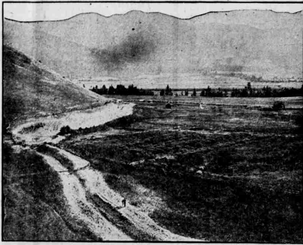
In the Jocho Valley of the Flathead Reservation

The country in which they grew up is rich in the grandeur of scenery, with a wealth of tradition and historical incident. The valleys and hills abound in retreats, each with its own myth and story. Wonderful waterfalls and lakes are to be found everywhere, adding charm and mystery to the one-time haunts of primitive man. Now the Indians are passing and the footprints of his outward path are being obliterated by the vineyard, the orchard and the field of grain. Thus the ambition of the white man is gradually encroaching upon the Indian lands, and a peaceable coercion is being used to induce him to retreat farther back.