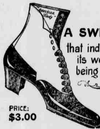
A SWELL BOOT that individualises its wearer as being exclusive.