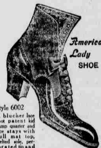
American Lady SHOE

Style 6002 A blucher lace boot patent kid vamp quarter and lace stays with dull mat top, welted side, per- forated tip and military heel. "Vassar" Toe