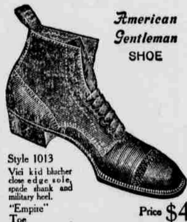
American Gentleman SHOE

Over 60 styles for your selection. We carry a BIG stock of Shoes. We have just received the first installment of our new 1909 Spring Line of the Correct Styles in Shoes. Prices from 25 cents to $6.00 a pair.