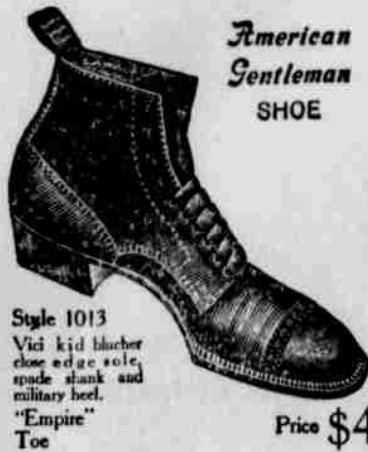
American Gentleman SHOE